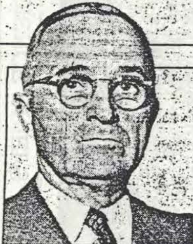
The New York Times

ferent from those observed or postulated in homo-sapiens."